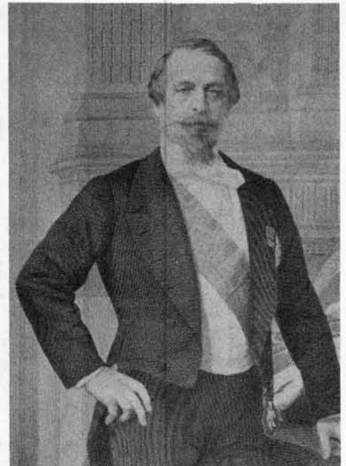
Lord Palmerston's three leading stooges who enabled British intelligence to control continental Europe. Left to right: "Young Italy" terrorist and British agent Giuseppe Mazzini; the British aristocrat David Urquhart, founder of modern communism; and Palmerston's French catamite, Emperor Napoléon III.

in the name of the pound. Then, in January 1848, Lord Palmerston arranged an insurrection in Sicily, using British networks that went back to Lord Nelson.