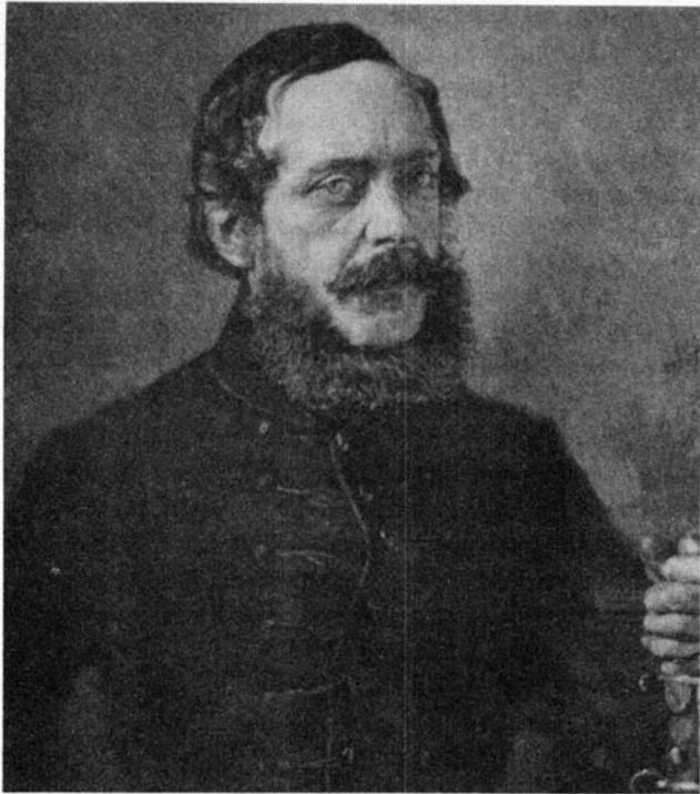
Louis Kossuth, leader of the Hungarian side of Palmerston's 1848-49 effort to forcibly retire the Austro-Hungarian empire as one of Europe's policemen.

dagger which Harmodius crowned with roses; holy was the dagger of Brutus; holy the poniard of the Sicilian who began the Vespers; holy the arrow of Tell." Vintage Mazzini. London's future ability to assassinate men like Walter Rathenau, Jürgen Ponto, Aldo Moro, Alfred Herrhausen, Detlev Rohwedder, stretches back in unbroken continuity to the Mazzini networks of today.