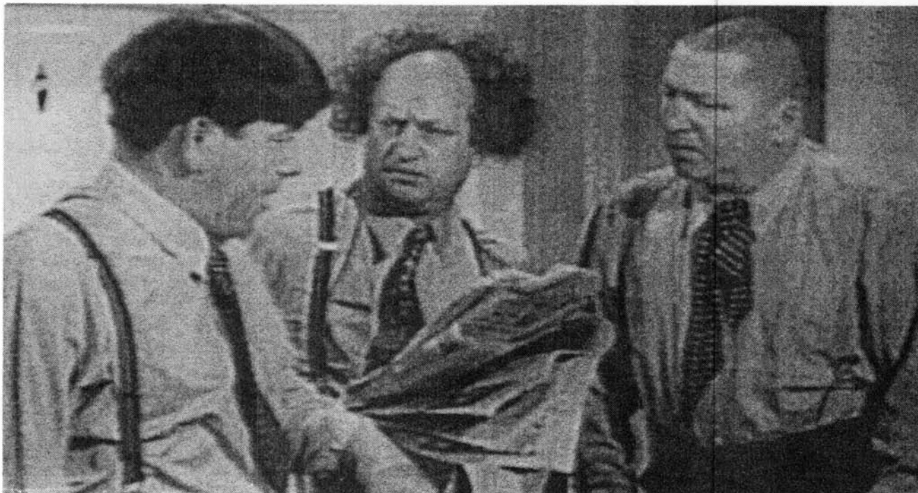
The Three Stooges' personal relations epitomize the continual, infantile violence among the inmates in Palmerston's Zoo.